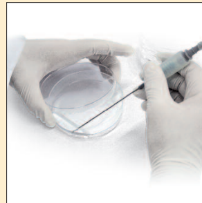
Coating of Petri dishes